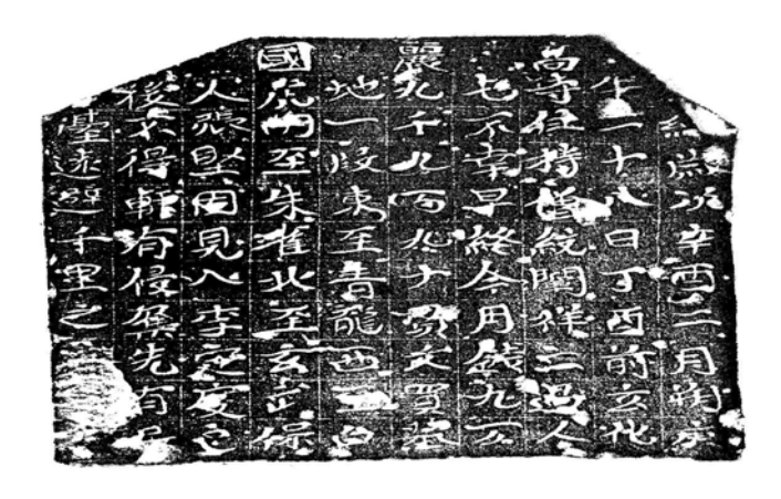
Fig. 1. Ch'ŏnsang's epitaph.

are former dwellers of the platform,5 that they be sent far away a thousand vi from it. ... Ouickly, quickly in accordance with the statue of the law (KMCC, 72, pl. 15).7