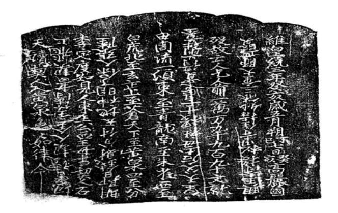
Fig. 2. Sehyŏn's epitaph.

In comparison with Ch'ŏnsang's epitaph, the inscription for Sehyŏn is both lengthier and more detailed. However, the details do not really concern the latter's life, but are formulaic and ritualistic in nature. One may say that the epitaph is more strongly informed by Chinese mythology and lore than that of the former.