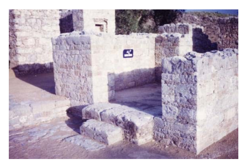
Fig. 3. Site of Jaulian.

their excavator, Sir John Marshall, placed them considerable later. In fact he contended, for reasons never very systematically argued, that they were as late as the fifth century A.D., representing a completely distinct revival of artistic output which he termed the "Indo-Afghan School." The reason for this designation was a very material one. For just as Taxila was characterized by the output of sculpture in stucco, so was the site of Hadda in Afghanistan. If Taxilan work belonged, as Marshall maintained, to the fifth century A.D., then so must some or all of that at Hadda. Then arose the need to assume a distinctive "Indo-Afghan" school linking the two.