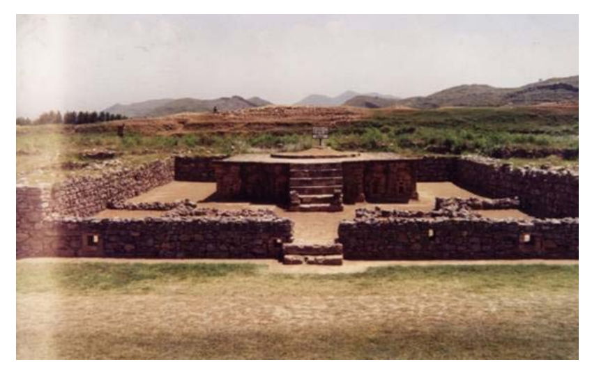
Fig. 4. Site of Sirkap.

used for the mixing of lime stucco and their floors were composed of Gandhara relief's laid face downwards. As the reliefs in question were already in a sadly worn and damaged condition when they were let into the floor, it may safely be inferred that a considerable period, say a century or more, had elapsed between the time when they were carved and the construction of the pits, which from the character of the walls appears to have taken place in the fourth or fifth century A.D.