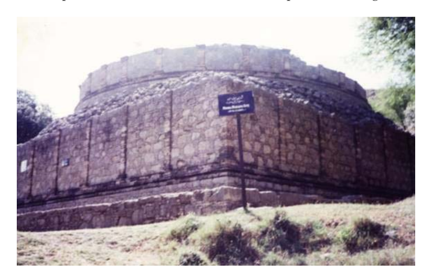
Fig. 2. Site of Mohra Moradu.

The geographical limits of the artistic province of Gandhara, to east and west respectively, are conveniently fixed by the sites of Taxila and Nagarahara, the last great city represented archaeologically by the site of Hadda. At Taxila the principal site, that of sirkap, lacks the Gandhara Buddha. At such well-preserved monasteries as Mohra Moradu (Fig. 2) and Jaulian (Fig. 3), religious retreats, we may suppose, occupied after the fall of the city, Buddhist sculpture survives in profusion, though the preferred material is stucco. These sculptures are most probable later than the fall of Sirkap 60 A.D. (Fig. 4) and