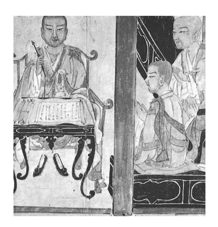
Master Wonhyo, lecturing on the Vajrasamādhi-sūtra