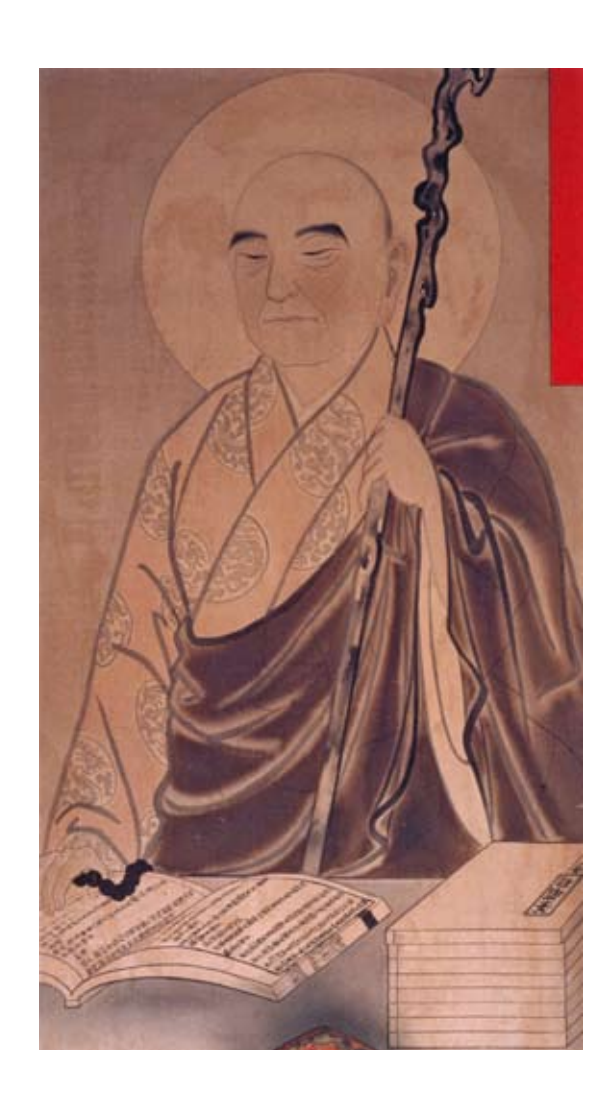
Portrait of Master Wonhyo. Property of Bunhwangsa